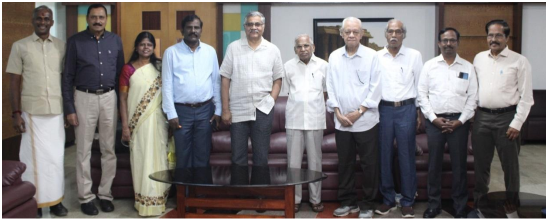
Delegates with the Chairman (fifth from left)